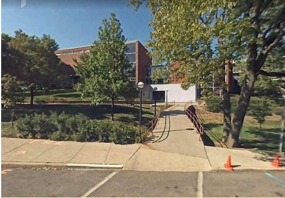
Blue Box Entrance on Clifton Court

DAAP Saturday Art takes place on the fifth floor of the Wolfson Center in the university classrooms. The Saturday Art program will be in session during the hours of 10:00 a.m. to 12:00 p.m.